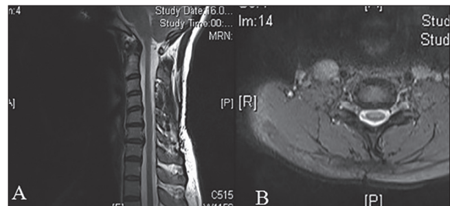
Figure 3: (a and b) Cervical sagittal and axial T2-weighted MRI demonstrating that soft disc herniation was removed and the lordosis was protected

observed very frequently. The diagnosis can be easily made with cervical radiographies, cervical MRIs, and cervical CTs. Surgical treatment is required in cases not responding to medical treatment. [10]