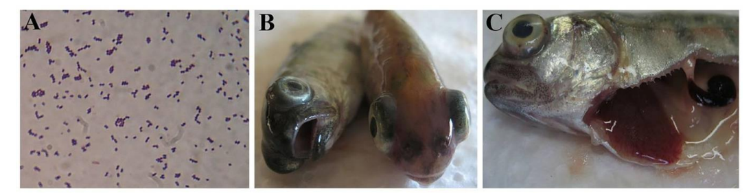
Figure 2. Gram staining of L. garvieae (A), bilateral exophthalmia (B), and haemorrhagic lesions on the liver and spleen (C).