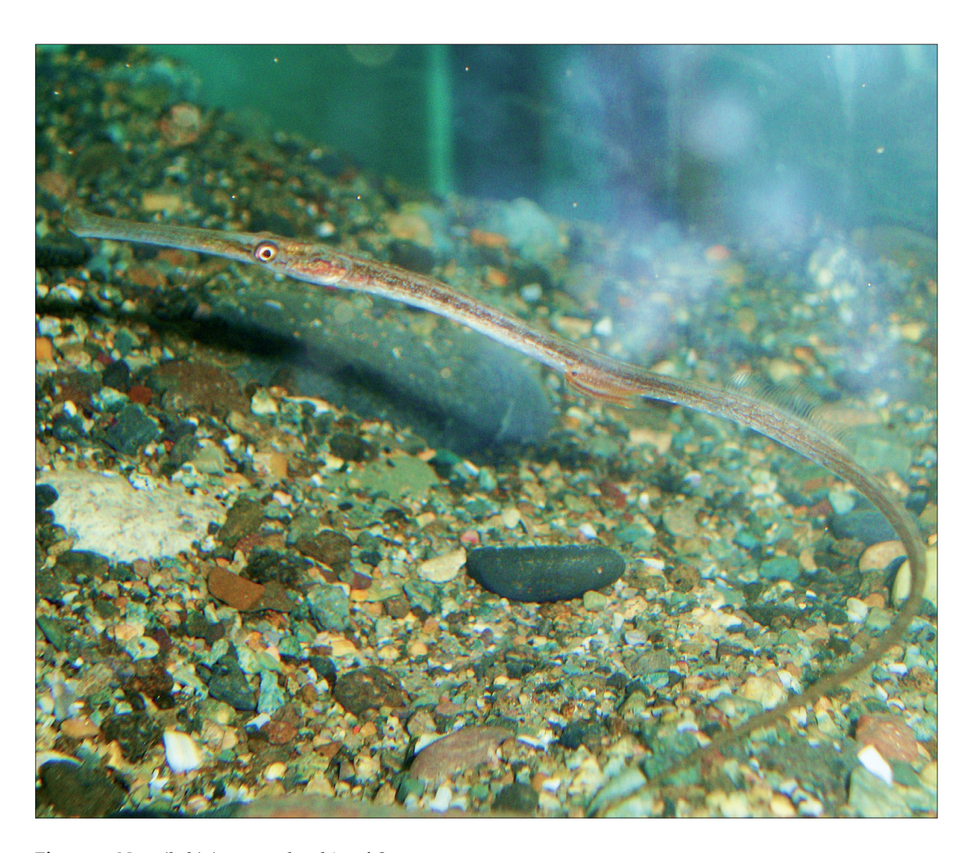
Figure 1. Nerocila bivittata on the skin of Sygnatus sp.