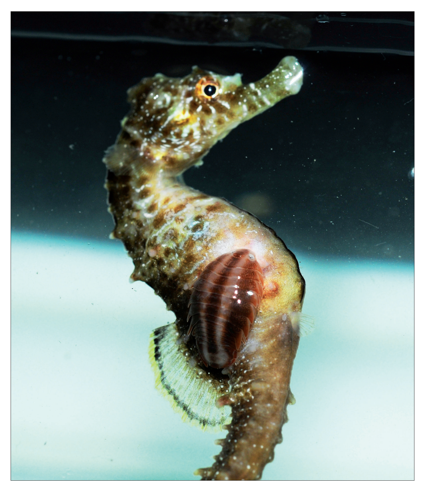
Figure 2. Nerocila bivittata on the pouch of Hippocampus guttulatus in water.