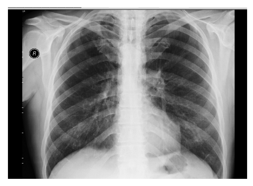
Figure I Bilateral hyperlucency is visible in this X-ray.

a double aortic arch. Normally, the left fourth arch regresses and forms the aortic arch. If the left fourth arch regresses and the right arch remains, this will result in a right-sided aortic arch.<sup>3,4</sup> Classically, DAA has three types; right dominant aortic arch, left dominant aortic arch, and balanced-type aortic arch. In 75% of the cases, the right arch is dominant and in