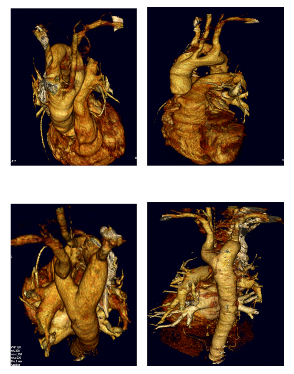
Figure 3 Computed tomography images of the patient's trachea in relation to neighbouring tissues.

study with DAA had an intracardiac defect.<sup>7</sup> 22q11 deletion was reported in 14% of the patients with normal intracardiac anatomy and DAA.<sup>8</sup> Symptoms are caused by compression of the trachea and the esophagus. At birth and in early infancy, symptoms such as respiratory distress, feeding difficulties, recurrent pneumonia, stridor, and dysphagia may occur as a result of tracheal and/or esophageal compression. But partial compression can lead to asymptomatic presentation, as shown in our patient. Adults with asymptomatic DAA are rare in literature. Presence of double cuts in right upper and left lower zones in tracheal air column is a significant finding. Barium esophagography may reveal esophageal compression but since the patient had no difficulty in swallowing we did not carry out