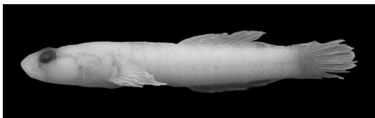
Figure 2. Chromogobius zebratus , male, 27.7 + 6.3 mm, FFR 1023, Arsuz, Hatay, south of Turkey, January 2006.

and G. Dalgıç. Meristic characters and morphometric measurements were obtained under a binocular microscope (to the nearest 0.01 mm) following Miller (1988). Meristic abbreviations: A, anal fin; C, caudal fin; D1, D2, first and second dorsal fin; P, pectoral fin; V, pelvic disc; LL, scales in lateral series; TR, scales in transverse series. Morphometric abbreviations: Ab, anal fin base; Ad and Aw, body depth and width at anal fin origin; Cl, caudal fin length; CHd, cheek depth; CP and CPd, caudal peduncle length and depth; D1b and D2b, first and second dorsal fin base; E, eye diameter, H and Hw, head length and width; I, interorbital width; Pl, pectoral fin length; PO, postorbital length; SL, standard length; SN, snout length; SN/A and SN/AN, distance from snout to vertical of anal fin origin and anus; SN/D1 and SN/D2, distance from snout to origin of first and second dorsal fins; SN/V, distance from snout to vertical of pelvic fin origin; V/AN, Distance from pelvic fin origin to anus; Vd, body depth at pelvic fin origin; VI, pelvic fin length. Terminology of the lateral-line system follows Sanzo (1911) and Miller (1986).