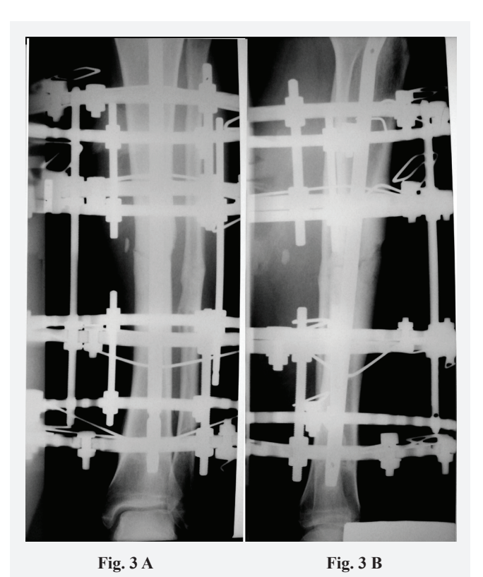
Fig. 3. Anteroposterior (a) and lateral (b) radiographs in postoperative 7th month

Fig. 1. Atrophic nonunion of the tibia following intramedullary nailing is seen on anteroposterior (a) and lateral (b) plain radiographs