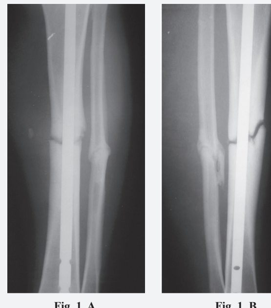
Fig. 1. A