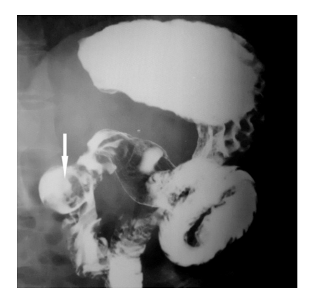
Fig. 2. Barium study shows an intraluminal filling defect of a bezoar in the diverticulum on the lateral wall of the second portion of the duodenum (arrow).