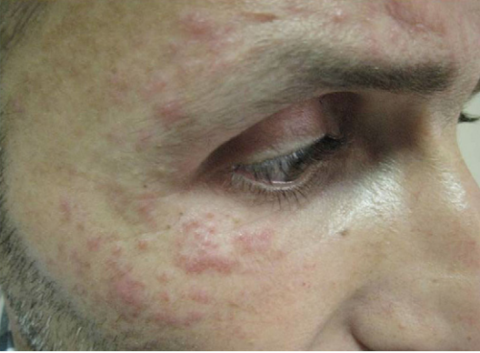
Fig. 1. The makuler, papuler and occasionally pistuler lesions are showing on the forehead and face.