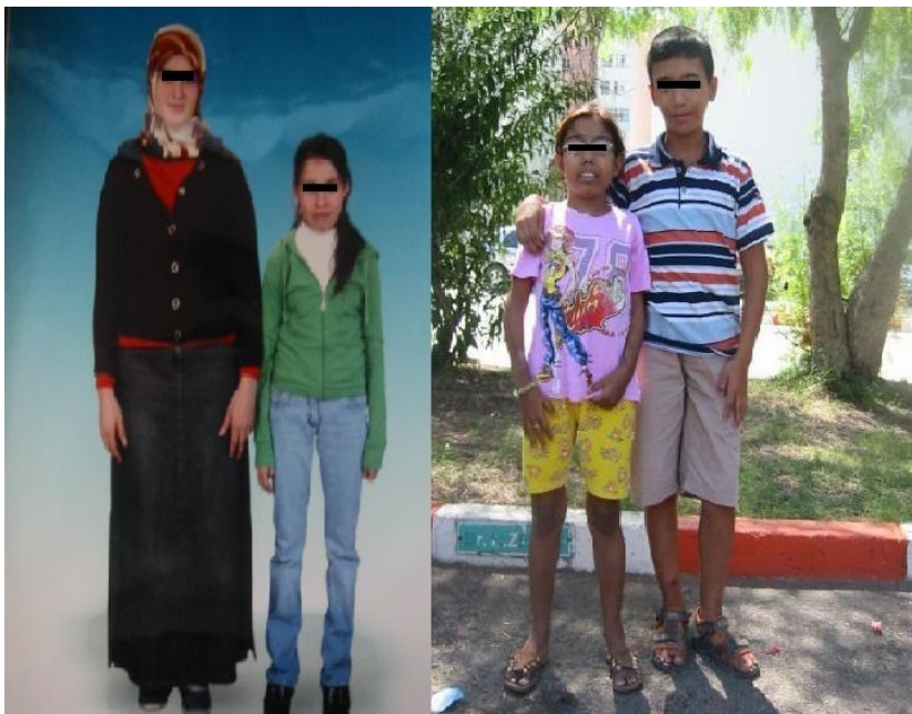
Figure 2. Left picture showing height differences in sisters. Right older and shorter girl is the patient with Sagliker syndrome who is shorter than her younger and sister. Right picture showing height differences in siblings. The girl who is on the left is the patient with Sagliker syndrome. She is older but quite shorter than her brother.

of parathyroid hormone secretion by calcium (20). CaSR in the parathyroid, thyroid, and kidneys is essential for calcium homeostasis. CaSR, located in the plasma membrane of the cell, detects changes in extracellular calcium concentration. When the extracellular calcium concentration rises, CaSR activates the G-protein signaling pathway, which reduces transcription of the