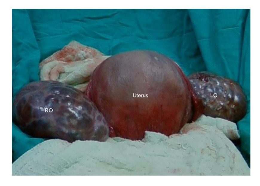
Figure 2. The appearance of spontaneous OHSS at 39 weeks of gestation during cesarean section.