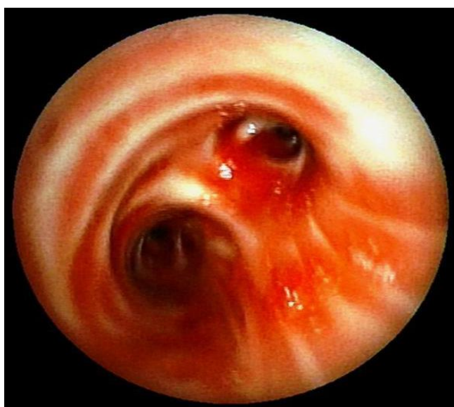
Figure 3: Fiberoptic bronchoscopy revealed diffuse airway erythema and bleeding