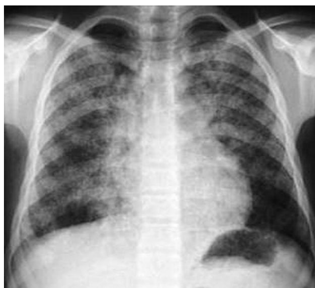
Figure 1: Initial chest x-ray showed bilateral alveolar infiltrates