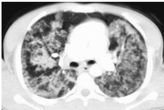
Figure 2: Thoracic computed tomography showed bilateral, diffuse ground glass opacities and interlobular septal thickening