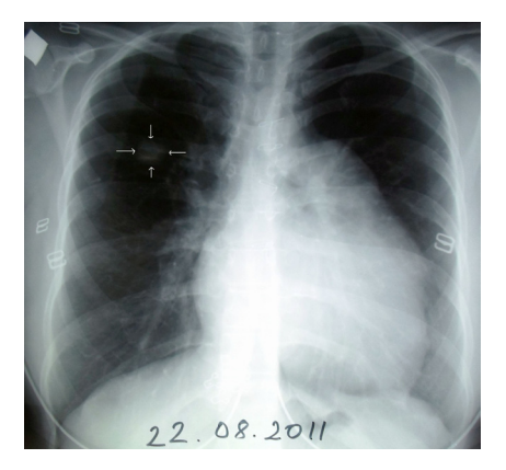
Figure 1. Chest X-ray showed an image of solitary pulmonary nodule located in right upper lobe and enlargement in left upper side of heart borders

Pulmonary artery aneurysm, especially the peripheral type, is a rare disease. We present an asymptomatic adult case whom had been underwent a series of correctional cardiovascular operations for Fallot tetralogy in her childhood period. A thirty year old female patient got a diagnosis of solitary pulmonary nodule (Figure 1). Contrast enhanced computed tomography (CT) and CT angiography revealed the aneurysm of posterior segment (A2 segment) of the right upper lobe artery (Figure 2 and 3). Prior to decision of diagnostic interventions, clinicians should be aware of an aneurysm of pulmonary artery can be a cause of peripheral solitary pulmonary nodules.