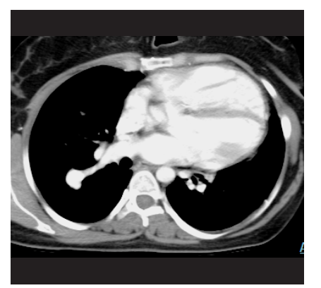
Figure 2. Contrast CT demonstrates focal contrast enhancement of pulmonary aneurysm communicating with pulmonary artery and located in the right upper lobe of the lung