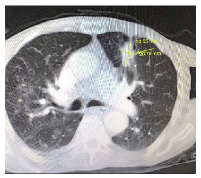
Figure 1: CT revealed a mass of 3x2 cm on the superior lobe of the left lung (yellow arrow).

Acantholytic SCC comprises 2-4% of all cutaneous SCCs. Many skin pathology textbooks histologically characterize SCC as adenoid (pseudoglandular) or pseudoacinar nests with central acantholysis and cohesive peripheral tumor cells. The skin is the most frequent site of acantholytic tumors, with common skin pathology references. Pulmonary acantholytic SCC results in an aggressive clinical course, with marked lymphatic metastases (4,5). p40 has high immunohistochemical sensitivity and specificity to distinguish lung adenocarcinoma and SCC and appears to be an excellent marker for SCC. p40 immunostaining should be performed routinely for the diagnosis of pulmonary SCC (6). The positive expression rates of TTF-1 and NapsinA are higher in lung adenocarcinoma, and TTF-1 is highly specific and sensitive in the diagnosis of adenocarcinoma. NapsinA may be used to distinguish ADC and SCC (7).