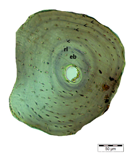
Figure 1. Cross-section of a phalanx of Darevskia valentini with an age of 5 years. Abbreviations: eb, endosteal bone; rl, resorption line.

The minimum and maximum SVL of species were 61.00-71.68 mm in females and 59.60-71.50 mm in males. The mean