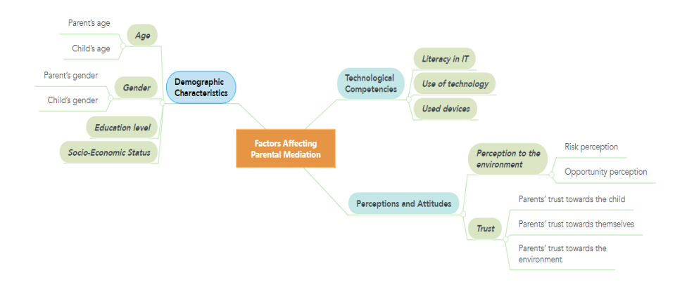
Figure 2. Factors affecting parental mediation