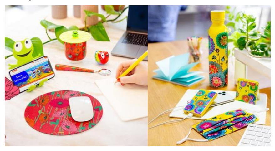
Figure 1: Pylones Cute Product Examples

Pylones, a French business, is one of the best examples of using humor in cute products. The business specializes in colored objects, as indicated on its online page. While Pylones designs cute products, it promises its customers to feel happy and to smile. As shown in Figure 1, Pylones markets a variety of cute products, from phone holders to mousepads, from spoons to masks, from phone cases to thermoses (The Pylones Adventure, 2017). It is obvious that the use of such products will bring happiness to consumers by providing emotional benefits.