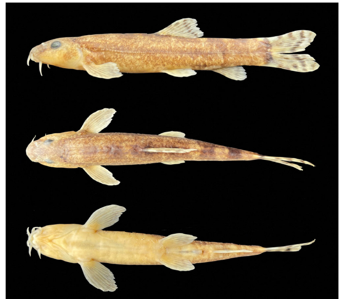
FIGURE 1 Oxynoemacheilus marmaraensis ; FFR 15631, holotype, male, 56 mm standard length (SL); Türkiye: stream Dursunbey.

Anal fin with 3 simple and 5½ branched rays, distal margin straight or slightly convex, and not reaching caudal-fin base. Pectoral fin with 1 simple and 9–10 branched rays, outer margin straight in most individuals.