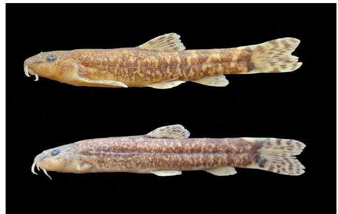
FIGURE 2 Oxynoemacheilus marmaraensis ; FFR 1511, paratypes; from top, male, 53 mm standard length (SL); female, 52 mm standard length (SL); Türkiye: stream Dursunbey.

Dorsal fin with 3 or 4 simple and (7½) 8½ branched rays, outer margin straight. Pelvic fin with 6–7 rays, outer margin straight, and almost reaching to the anus. Caudal fin forked and lobes slightly rounded.