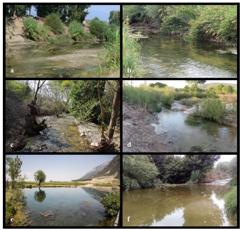
Figure 2. Habitat of Petroleuciscus ninae : a, Stream Akçay; b, Yenicekent DSİ pom station, Büyük Menderes River; c, inflow of Yenişehir Pond, Küçük Menderes Drainage; d, Stream Balaban, Tahtalı Reservoir Drainage; e, Spring Gemiş, Lake Acı Basin; f, Sarıçay River.

The zoogeographic distribution of Petroleuciscus ninae and P. smyrnaeus in the Turkish Aegean Sea drainages, with P. smyrnaeus inhabiting between the rivers Bakırçay and Gediz (around İzmir), and P. ninae inhabiting Tahtalı Reservoir basin to the north and Sarıçay River to the south, nested within the range of the Capoeta and Chondrostoma species in the same region. Capoeta aydinensis and Chondrostoma turnai distributed in Büyük Menderes River and southern