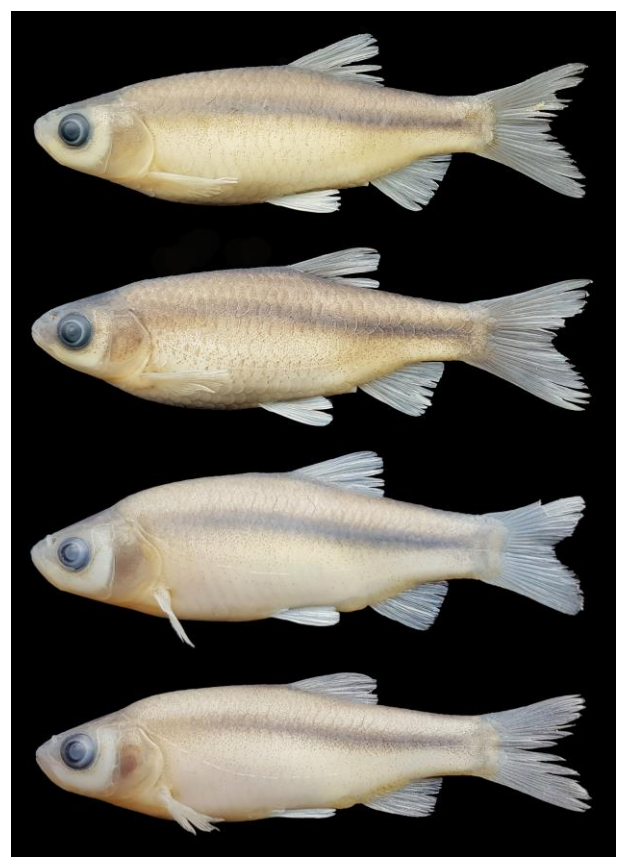
Figure 4. Petroleuciscus ninae , from the top: FFR 3860, 71 mm SL; 66 mm SL; Türkiye: inflow of Yenişehir pond, Küçük Menderes drainage; FFR 3861, 50 mm SL; 40 mm SL; Türkiye: a northeastern drainage of Tahtalı Reservoir.