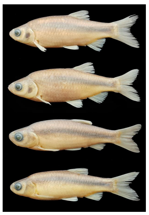
Figure 3. Petroleuciscus ninae , from the top: FFR 3845, 82 mm SL; 78 mm SL; Türkiye: stream Sarıçay; FFR 3854, 74 mm SL; 71 mm SL; Türkiye: Lake Acıgöl.