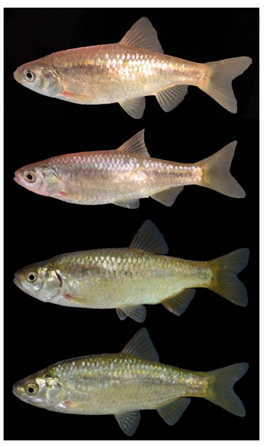
Figure 5. Petroleuciscus ninae , from the top: FFR 3860, 71 mm SL; 64 mm SL; inflow of Yenişehir Pond, Küçük Menderes Drainage; FFR 3861, 50 mm SL; a north-eastern drainage of Tahtalı Reservoir; FFR 3853 72 mm SL; Yenicekent DSİ pomps, Büyük Menderes River; not preserved, about 60 mm SL, Stream Akçay Büyük Menderes drainage.