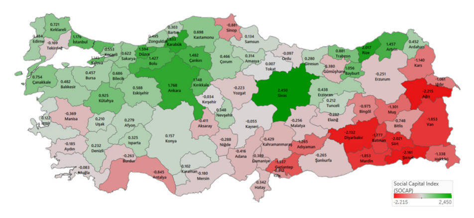
Figure 1. Social capital index in Türkiye in the year 2018

This social capital index was derived for the first time in Türkiye to cover a period of twelve years for 81 provinces. Likewise, Rupasingha et al. (2006) derived the social capital index on a provincial basis for the years 2007, 2011, and 2018 by subjecting two networks and two norm measures to principal component analysis. Subsequently, the linear interpolation method was applied to the remaining years. This index generation method is the most comprehensive method used in many other studies (Alesina & La Ferrara, 2000; Davaadorj, 2019; Hasan et al., 2017; Jha & Chen, 2015; Jin et al., 2019; Knack, 2003; Rupasingha & Goetz, 2008). A positive and large value of the social capital index represents higher social capital and vice versa . The respective data for Turkish provinces in 2018 are displayed in Figure 1.