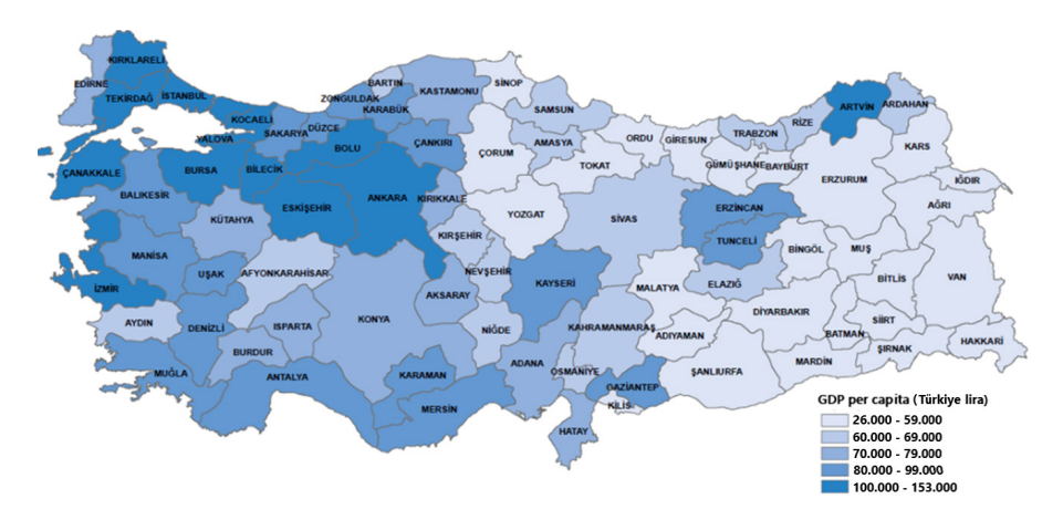
Figure 2. GDP per capita in Türkiye in the year 2018

Note: As of 7.08.2023, 1 US dollar = 27 Turkish lira.