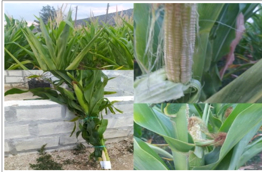
Fig 1: Experiment setup and harvest.

effectiveness compared to organic fertilizers. Vermicompost exhibited the poorest silage quality, with the highest ADF ratio, while cattle and poultry manure resulted in the lowest quality silage. Our results ranged from 30.55% to 20.11%, aligning with some previous studies (Zhao et al. , 2022; Ma et al. , 2023; Koenig et al. , 2023; Chayanont et al. , 2021; Liu et al. , 2021), but differing