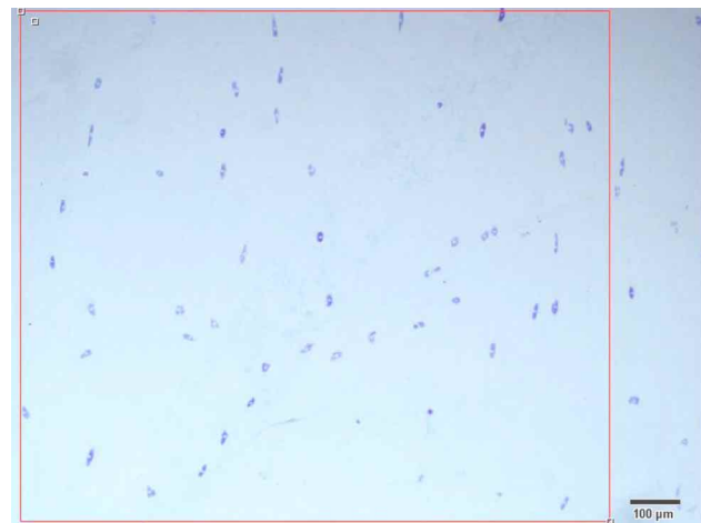
Fig. 1. Mast cell and degranulated mast cell were counted using the Olympus DP2-BSW (Ver.2.1 to Ver.2.2, Build 6212, Olympus Corporation, Tokyo, Japan) software system.

The fixed tissues were dehydrated in graded ethyl alcohol series and stained with Toluidine Blue. Sections were examined under a light microscope (BX51, Olympus, Tokyo, Japan) and photographed at relevant magnifications with attached digital camera (DP72, Olympus, Tokyo, Japan). Total and granulated mast cells were counted in 15 different sections in each slides, total of 7 slides, 1200 \mu\text{m}^2 (Fig. 1).