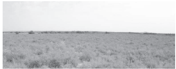
Fig 7. Frankenio pulverulentae-Chenopodietum albi .