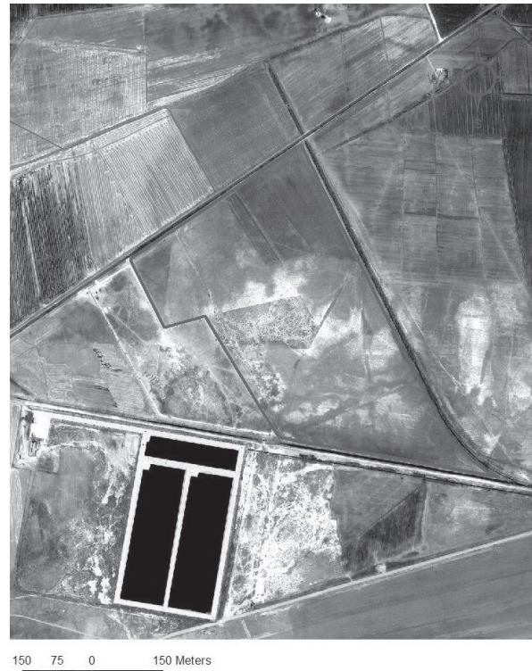
Fig 2. The study area according to IKONOS.

When soils are assessed in terms of EC (electrical conductivity), it can be seen that all associations grow in highly saline soil (EC>15) and that associations were differently resistant to salt. Analysis results show that the association with best resistance against soil salinity is Hymenolobo procumbentis-Aeluropetum lagopoidis , the ones with medium-resistance to highly saline environments are Halothamno hierochunticae-Salsolietum incanescens and Frankenio pulverulentae-Chenopodietum albi , and Prosopo farctae-Alhagietum manniferae is the association with lowest tolerance. In addition, from observing