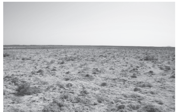
Fig 3. The saline soil of the study area.

Two associations that can be included in this