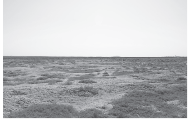
Fig 6. Hymenolobo procumbentis-Aeluropetum lagopoidis .

Prosopo farctae-Alhagietum manniferae ass. nov. (Table 7) (Fig. 8)