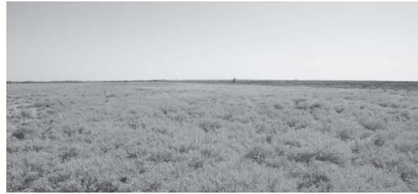
Fig 5. Halothamno hierochunticae-Salsolietum incanescens .

This association is holotypus of the alliance. Therefore, the characteristic species and ecological preference are similar. The physiognomy is dominated by Salsola incanescens C.A.Mey. The association spreads in halophytic area of Harran