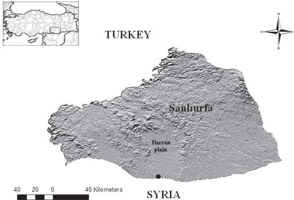
Fig 1. Location of the study area (•).

many vegetation applications and plannings easier through data assessments, updating, mapping and tracing. Remote sensing data provides useful information on terrain usage, crop pattern, plant development, plant productivity, plant-water requirement, evapo-transpiration calculation and salinity depending on the level of accuracy (Bayramov and Mamedov 2008). Remote sensing has many advantages in land measurements. Information obtained with remote sensing techniques is not only theoretical; they are based on measurements on the ground. Remote sensing information can be obtained systematically; they also allow for comparison of time-related changes. Satellite data which allow for instant sensing of wide areas also facilitate analysis, updating and combination with other data by transferring them to GIS media (Bastiaanssen et al. 2000, Güleriyüz and Arslan 2001).