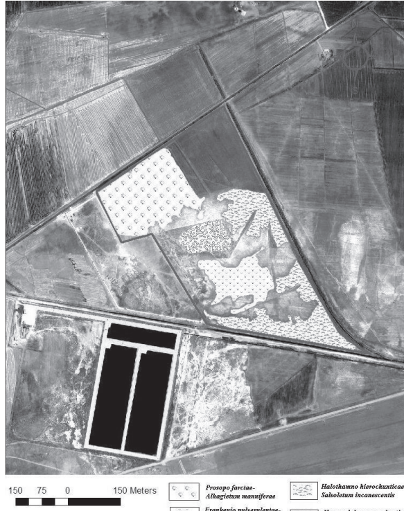
Fig 9. Distribution of the associations in the study area according to IKONOS.

tolerance was good for high saline ratio in the soil. Characteristic taxon of the association, Aeluropus lagopoides (L.) Trin. ex Thwaites var. lagopoides , is included in the type composition of many associations detected in salt deserts and coastal saline areas by Zohary (1973).