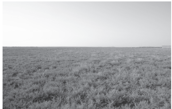
Fig 8. Prosopo farctae-Alhagietum manniferae .

Holotypus: relevé 12, 341 m, cover 80%, 40 m 2