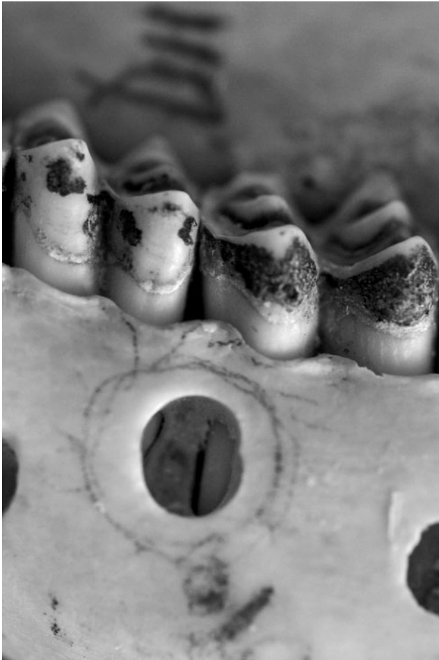
Figure 1 Bone defect created with a burr on the vestibular side of the sheep mandible

CBCT scans of the defects were taken with a new CBCT system (Kodak 9500 Cone Beam 3D System, Kodak Dental Systems, Carestream Health, Rochester, NY) (Figure 2). This system has 2 field of views (FOVs) (9 × 15 cm and 18.4 × 20.6 cm), a minimum 0.2 mm