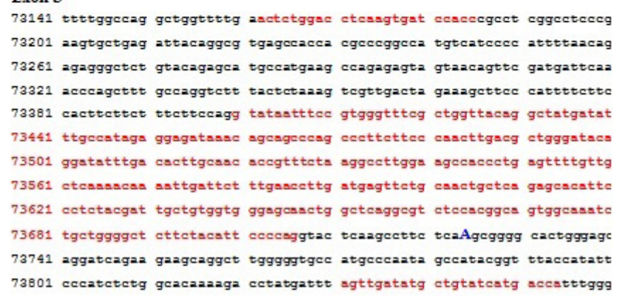
Figure 4. Complete sequences of exons 2 and 3 of the CaSR gene. Exon sequences and primers sequences are illustrated with red letters whereas base alterations are illustrated with blue capital letters.

results in no protein sequence alteration. Other sequence variations at positions 70239, 70471, and 73724 are outside of the boundaries of the coding regions, so these alterations do not have any effect on the gene product. Our findings show that hyperparathyroidism, hypocalcemia, and hyperphosphatemia were not associated with CaSR polymorphisms in these SS patients. Mutations in exons 2 and 3, which are postulated to encode the large extracellular domain of this protein, produce two different phenotypes. While most of the mutations identified in this region cause FHH and NSHPT , one mutation, 128Glu-Ala, results in autosomal dominant hypocalcemia (25). The divergent phenotypes associated with these mutations suggest that the extracellular domain is critical for determining the receptor's affinity or interaction with Ca<sup>2+</sup>;