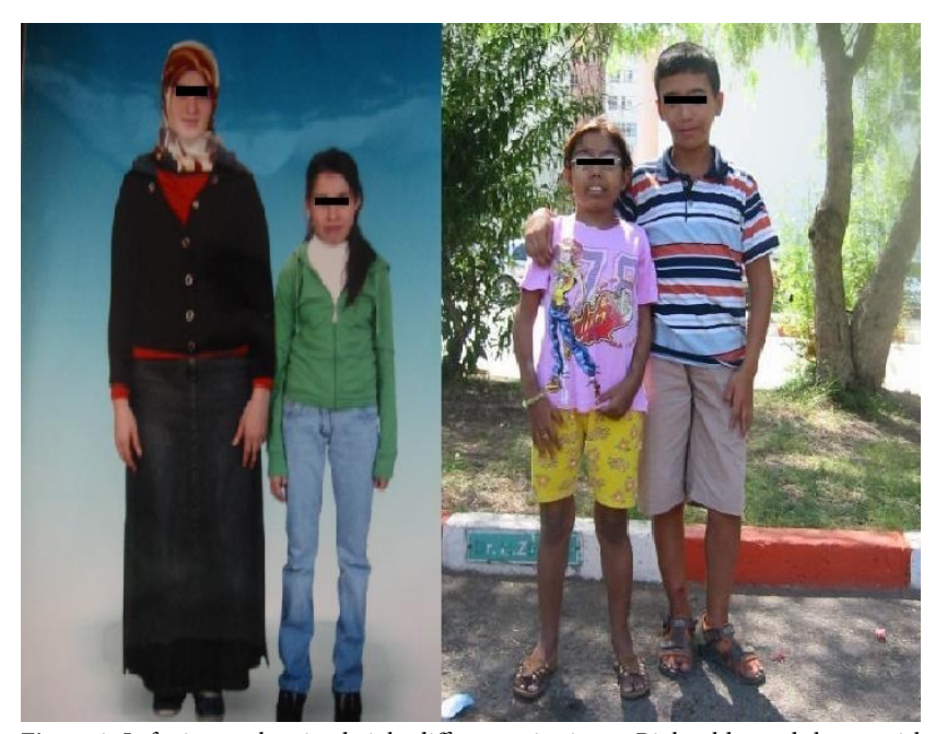
Figure 2. Left picture showing height differences in sisters. Right older and shorter girl is the patient with Sagliker syndrome who is shorter than her younger and sister. Right picture showing height differences in siblings. The girl who is on the left is the patient with Sagliker syndrome. She is older but quite shorter than her brother.

of parathyroid hormone secretion by calcium (20). CaSR in the parathyroid, thyroid, and kidneys is essential for calcium homeostasis. CaSR, located in the plasma membrane of the cell, detects changes in extracellular calcium concentration. When the extracellular calcium concentration rises, CaSR activates the G-protein signaling pathway, which reduces transcription of the