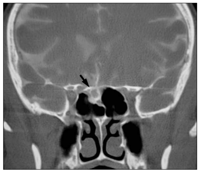
Figure 2: CT cisternography of the patient showing a sphenoid sinus roof defect and herniated pseudomeningocele beneath (arrow).

predisposes to potentially life-threatening consequences and sudden cerebral death occurs frequently by the involvement of the brain stem (9,24). After a non-lethal craniocerebral GW, various collateral damages could happen in the neighboring structures. One of them is skull base injury, which could cause CSFr (9).