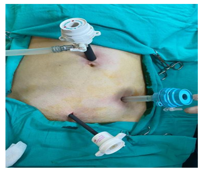
Fig. 1. Locations of the trocars

The mesoappendix was resected with a 5 mm vessel closure device ligasure (CovidienTM LigaSureTM Maryland Jaw Laparoscopic Sealer/Divider, Unites States). In Group 1, a single EL was placed on the base of the appendix, and in Group 2, a single HC was placed on the base of the appendix and cut using a ligasure (Fig. 2). Different methods were used when the stump of the appendix could not be closed safely using a single EL or a single HC. Laparoscopic stapler, double EL or double HC were used in these cases, but these cases were excluded from the study. The use of a drain was not standard, this was decided during the procedure. A sampling bag was used for perforated appendicitis.