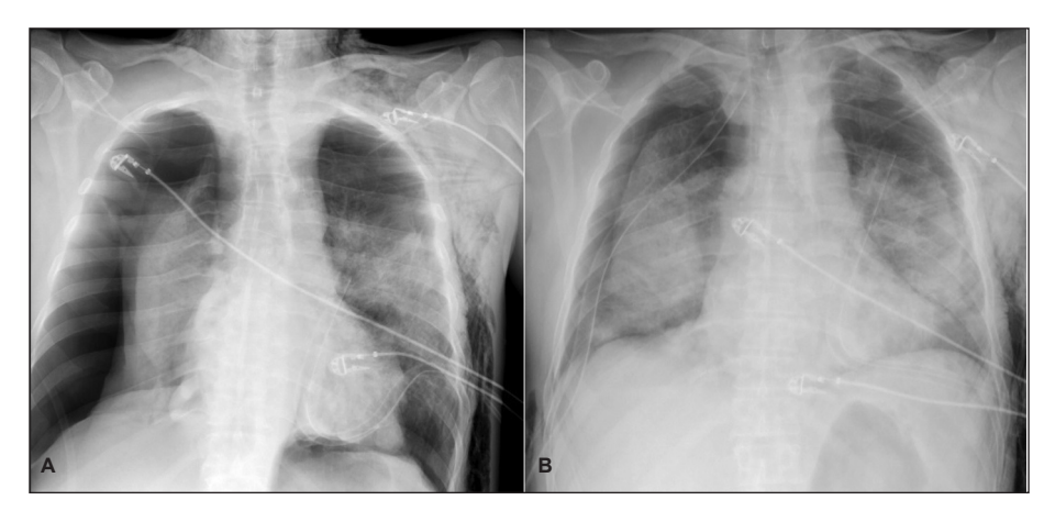
FIGURE 4: A) P-A chest radiography reveals the pneumothorax line in the right hemithorax. B) Intense infiltration is observed in the lung tissue expanded by tube thoracostomy in both lungs.

ever, the patient died while being followed in the intensive care unit due to respiratory failure. Written consent was obtained for this case report from the patient's relative.