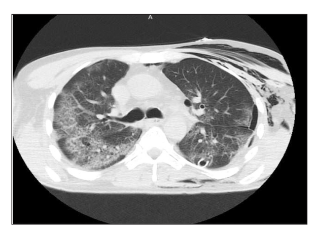
FIGURE 3: Due to the progression of parenchymal infiltration on chest radiography, the computed tomography performed again shows progression in both lung parenchyma.